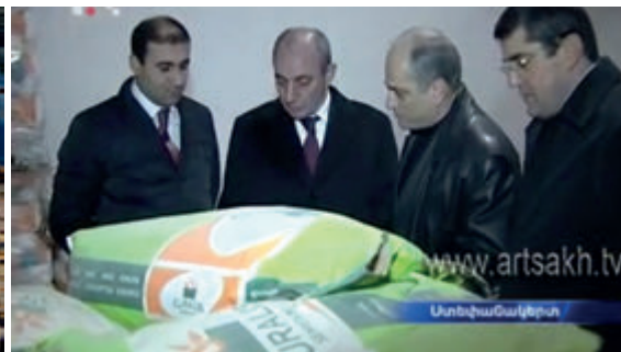
"Euralis" and other seeds used to grow settlement produce in the occupied territories are provided by Armenia