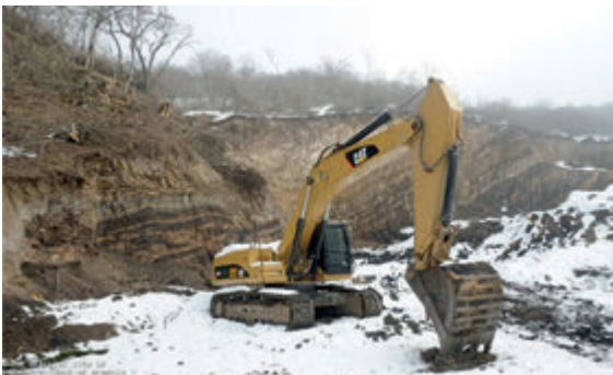
Coal mine near Chardagly village in the occupied Tartar district | Photo from www.president.am | 05 January 2012

The new road will also be used to transport coal from the coal mine near Chardagly village in the occupied part of the Tartar district. 480 Since 2013 the coal extracted at that mine has been reportedly transported by Armenia-registered cargo company Hana-Trans LLC via alternative routes to the thermal power plant in Yerevan, which consumes 2,000 tons of coal daily. 481 The coal is brought by trucks to Vardenis (Armenia) railway station and from there to Yerevan by railway. Armenia-registered Energy Plus Ltd. company has been granted by the Government of Armenia a three-year VAT payment deferment to develop this mine. 482 The coal supplies enable operation of two units of the Yerevan power plant with 50 MW capacity each. The energy produced in the plant is for both domestic use in Armenia and for export. The close supervision of that coal mine development by the President of Armenia, who frequently visits the mine (he