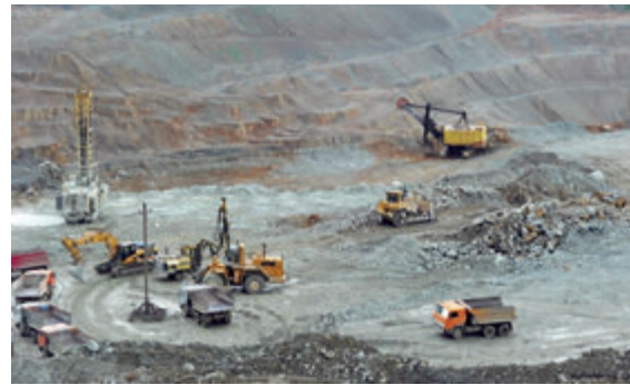
Exploitation of Soyudlu gold mine in the occupied Kalbajar district

270 tons 460 ). Extracted unprocessed ore is transported for processing to Armenia by rail at a crushing and screening plant and then to Ararat Gold Processing Plant. The company exports 99 percent of Armenia's total gold exports. 461 In 2013, the company was ranked as the number one taxpayer (7.261 billion AMD) in Armenia. Since 2007, GeoProMining has invested some $260 million into GPM Gold and Agarak Copper-Molybdenum Mine Complex. 462 The money was used to upgrade the extraction technology at the Ararat plant, which was not designed to process the