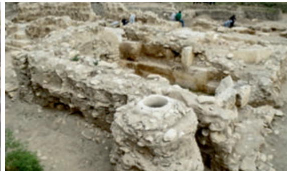
Illegal archaeological excavations in the vicinity of the occupied town of Aghdam

In the town of Shusha, the architectural monuments, such as the Yukhary and Ashaghy Govharagha mosques with their madrasahs, the mausoleum of Vagif, and the house of Natavan and caravanserais, have been destroyed, burnt and pillaged.