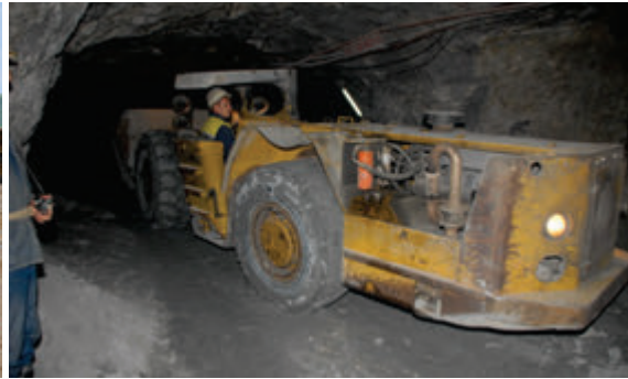
Exploitation of the Gyzybulag underground mine near Heyvaly village in the occupied Kalbajar district

processing 350,000 tons of ore annually, 428 producing some 20,000 tons of ore concentrates per annum or 1200 tons monthly. 429 According to Arthur Mkrtumyan, Director General of Base Metals CJSC and Vice-president of the Vallex Group, as of October 2013, out of 3,2 million tons of total reserves 3 million tons have been extracted. 430 Concentrate is transported to Armenia, where it is further processed by the Armenia-registered Armenian Copper Programme CJSC 431 into gold containing copper and exported to international markets, mainly in Europe. 432 Another Armenian source informs that the ore is refined only once and exported to Germany for further processing. 433 Mkrtumyan confirmed in 2013 that the mine had reserves for another two or two and a half years only. 434