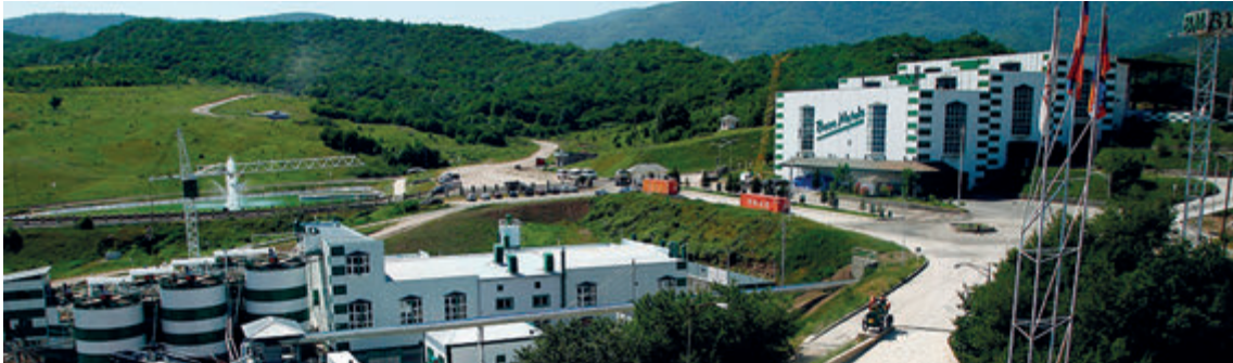
Armenia's Vallex Group through its Base Metals subsidiary exploits Gyzybulag underground gold and copper mine near Heyvaly village in the occupied Kalbajar district | 12 June 2012

The occupied territories of Azerbaijan are rich in natural resources. There are around 155 deposits of precious stones, minerals and base metals, including deposits of non-ferrous metal ores, gold, mercury, copper, lead and zinc, pearlite and other natural resources. 414 Among them are gold-copper-pyrite deposits in Gyzybulag, copper-gold, molybdenum deposits in Demirli,