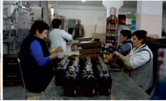
Production facility of the “Stepanakert Brandy Factory CJSC” | Photo from www.hetq.am | 10 December 2014

(Estonia), “Artsakh-Italy OJSC” (Italy), Yerevan-registered SAS online supermarket and Yerevan City supermarket chain of Armenia.