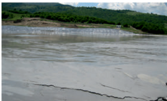
Depredatory exploitation of Gyzybulag mine in the occupied Kalbajar district produces millions tons of waste in tailing dumps, which are saturated with heavy metals and other dangerous substances

The exploitation of the natural resources accompanied by associated ecological disasters, such as tailing dumps and water pollution, has reached such a fast and unobstructed pace that even Armenia-based environmental organizations, including the Pan-Armenian Environmental Front (PAEF), raised red flag. 549