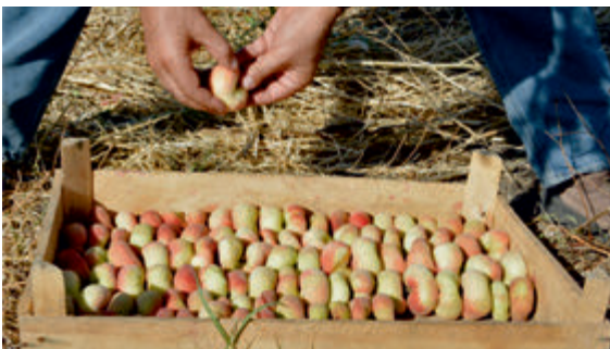
Settlement produce grown by Syrian Armenians in the occupied territories | | 04 August 2015

The Armenian Technology Group Inc. (ATG), operating in Armenia, made its "Seed Multiplication Project" available to the settlement farming in the occupied territories. Some 24 settlements in the occupied territories benefited from ATG's seeds program. 372