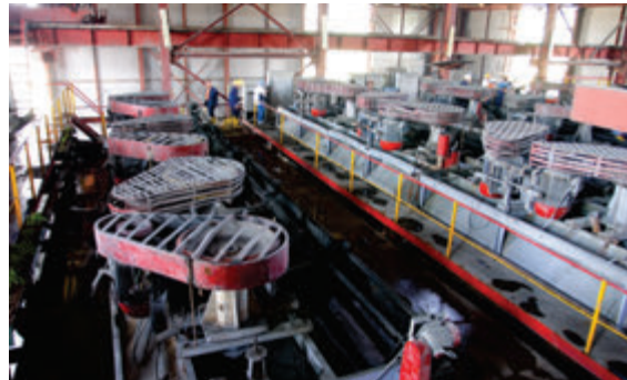
Ore processing plant at the Gyzybulag underground mine near Heyvaly village in the occupied Kalbajar district