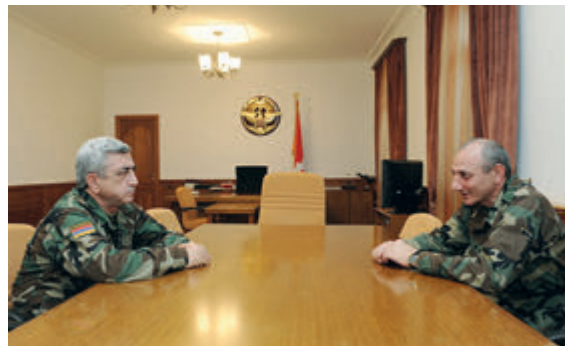
The close, almost umbilical, links between the subordinate separatist regime and Armenia have a strong personal element at the highest level. Above, President of Armenia meets with Bako Sahakyan | | 24 October 2012

Close connections of businesses operating in the occupied territories with the separatist regime and Armenian officials in Yerevan have been a matter of public repute in Armenia and elsewhere for a long time. 492 Incumbent President of Armenia Serzh Sargsyan and his predecessor Robert Kocharyan entered the politics in Armenia from within the ranks of the separatist regime and transferred their oligarchic networks established in the occupied territories with them to Yerevan. 493 All major business enterprises in the occupied territories are established, financed and controlled by