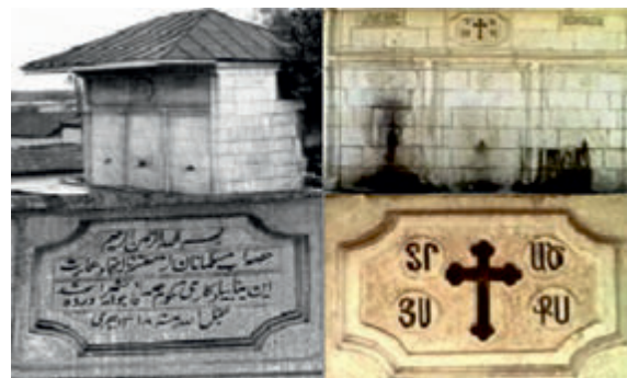
Mamayi spring in the town of Shusha before and after the occupation

Alleged “reconstruction” and “development” projects in Shusha and other towns and settlements throughout the occupied territories and “archaeological excavations” are carried out with the sole purpose of removing any signs of their Azerbaijani cultural and historical roots and substantiating the policy of territorial expansionism. Since the occupation of Shusha in May 1992, over 30 construction projects have been funded by Armenia and Armenian diaspora. As of 2014, a total of $11.5 million worth of infrastructural projects have been implemented in Shusha. 559 “Reconstruction” works also include the replacement of the Azerbaijani-Muslim elements of the monuments with alien ones, such as the Armenian cross and writings, which have been engraved on the Arabic character of the nineteenth century Mamayi spring in Shusha town.