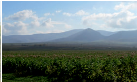
Tobacco plantations in the occupied territories of Azerbaijan | 23 November 2014