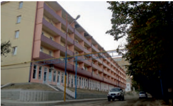
Newly reconstructed building in the occupied town of Shusha | 03 September 2014

The construction in 2015 of the healthcare facility for around 150 settlers who moved from Armenia to villages of Gushchu, Ashaghi Farajan and Safiyan in the occupied Lachyn district 210 is directly linked to promoting resettlement of a new population in that area. 211 Like many other facilities, the clinic is built on the ruins of demolished buildings, confirming the earlier reports that empty houses of Azerbaijani displaced persons are being dismantled for use as construction materials or that new houses are being built on their lands and properties. In 2013, construction of a kindergarten in the occupied town of Kalbajar and repair works in a hospital in the occupied town of Zangilan were launched. 212