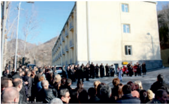
Commissioning of a newly constructed residential building in the occupied town of Lachyn

An extensive network of irrigation systems and water supply pipes is being built to service the settlements and illegal activities, especially in the agricultural sector, throughout the occupied territories (see below).