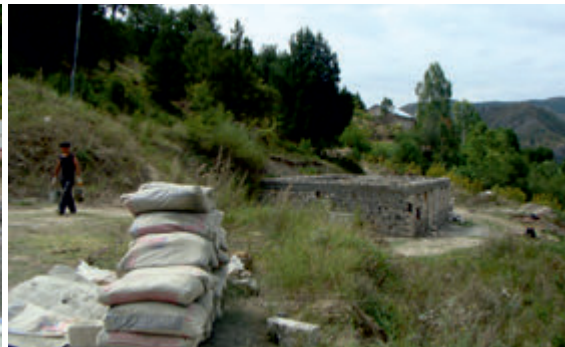
Construction of houses for the Syrian Armenian families settled in the occupied town of Lachyn | 02 September 2013