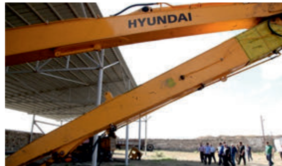
“Araks branch” of “Hadrout Agroecology CJSC” in the occupied Zangilan district | Photo from www.tert.am | 16 May 2013 |

In 2013, Tufenkian Foundation initiated greenhouse cultivation near Alibayli village in the occupied Zangilan district of Azerbaijan. With the co-sponsorship of the Armenian Community Council (ACC) of Great Britain, two greenhouses with a total area of 480m 2 were built. In 2014, some 1,873 kg of tomatoes were harvested. 344