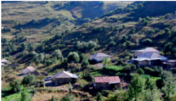
Armenian settlers in the Seyidlar village in the occupied Kalbajar district | Photo by Daniel Yan | www.flickr.com | 11 August 2015

Resettlement in the so-called “Kashatagh” (the occupied Lachyn, Gubadly and Zangilan districts) and “Shahumyan” 138 “regions” (the occupied Kalbajar district) is of particular importance to Armenia due to their “strategic value” 139 and economic attractiveness, including water resources, minerals, energy potential and ample agricultural opportunities. 140 A special “Kashatagh resettlement department” has been established to that end. As a result of the settlement policy, the number of settlers in the occupied town of Kalbajar has increased by 40 percent over seven years (2005-2012). 141 According to the so-called “governor” of the so-called “Kashatagh region”, Souren Khachatryan, in 2010-2013 alone, the number of settlers in region increased from 8,000 to 10,000. 142 While confirming the existence of a resettlement policy, he also admitted that the lack of adequate housing conditions affects the number of settlers that they can accommodate. It clearly shows the intention to settle more Armenians in the occupied territories in much shorter timeframe and that the lack of adequate accommodation facilities, including water shortage, apparently hinder the pace and the overall process of resettlement. 143