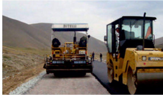
Construction works at the Vardenis-Aghdara highway passing through the occupied Kalbajar district of Azerbaijan | Photo from www.armenianfundusa.org | 10 November 2014

In 2008, Armenia launched reconstruction of the airport near the occupied town of Khojaly of Azerbaijan and manifested its intention to operate flights, including military ones, into/from the occupied territories. 204 Germany-based "Thales Air Systems GMBH" affiliate of the "Thales Group" (France) provided navigation equipment for this airport. A businessman from Argentina of Armenian origin, Eduardo Eurnekyan, purchased an aircraft to perform flights to the occupied territories. 205 Azerbaijan informed the international community that this airport, referred to by Armenia as "Stepanakert airport", is not an approved aerodrome under the legislation of Azerbaijan, nor is it a designated customs airport in accordance with the Convention on International Civil Aviation. 206 Consequently, all flights operated from and into that airport are unlawful and violate the said Convention and the fundamental principles and objectives of the International Civil Aviation Organization (ICAO). Since Azerbaijan, acting in the exercise of its sovereign right, has closed the airspace over the occupied territory for any aviation operations, no flight into or from this airport is authorised. ICAO, through its Secretary General confirmed the inadmissibility of unauthorised flights over the territory of Azerbaijan recognised by the United Nations. 207