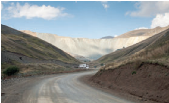
Unprocessed ore from Soyudlu gold mine in the occupied Kalbajar district is transported to Armenia via Zod pass | Photo by Andrey Kolchugin | www.panoramio.com | 20 September 2012