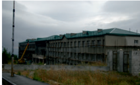
Construction/renovation of a residential building in the occupied town of Shusha

To maximize the use of water resources in the area, most of the Armenian settlements in Zangilan and Gubadly districts are generally established within 1-2 km of the Hakari River, which extends southward from the occupied Lachyn district toward the Araz River Valley. 382