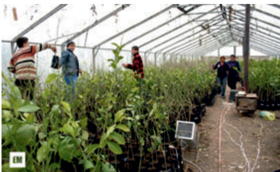
Syrian Armenians plant citrus in a greenhouse in the occupied territories of Azerbaijan | Photo from www.emedia.am | 2013

The Government of Armenia also allocates preferential loans (up to 5 million drams at a 10 percent reduced interest rate for up to five years) to Syrian Armenian small and medium-sized business owners to finance small production facilities. 183 Syrian Armenians settled in Lachyn, Zangilan and elsewhere in the occupied territories are eligible for those loans, since no distinction is made between the programmes for Syrian Armenians remaining in Armenia and those resettling in the occupied territories. 184