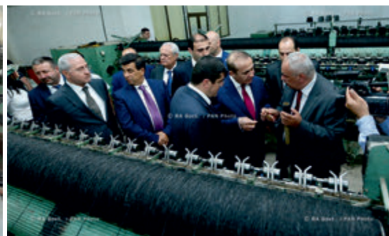
Prime Minister of Armenia Hovik Abrahamyan visits “Metax” company in the occupied territories

03 March 2015