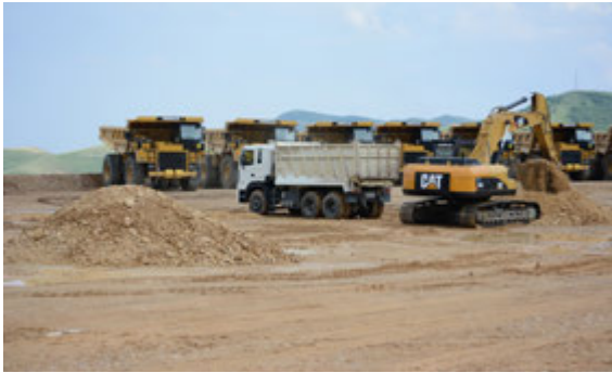
Armenia's Vallex Group provides heavy machinery for the exploitation of Demirli copper-molybdenum deposit in the occupied part of the Tartar district | Photo from www.bm.vallexgroup.am | 27 May 2014