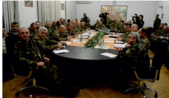
President and Minister of Defence of Armenia routinely participate in the military planning exercises in the occupied territories | Photo from www.president.am | 16 November 2013

The close, almost umbilical, links between Armenia and the subordinate separatist regime have a strong personal element at the highest level, in addition to a whole range of other connections. Military occupation and control of the territories of Azerbaijan by Armenia's armed forces and, in general, accessibility of the occupied territories only from Armenia and with the permission of Armenia's local agents attest to the acquiescence and connivance of the State organs of Armenia in the acts of subordinate regime, its military formations, as well as of natural and legal persons, private individuals and entities of Armenia and some other countries, operating in the occupied territories. The presented evidence leaves no doubt that the subordinate separatist regime and its armed formations act on the instructions and under the direction and control of the organs of the Republic of Armenia and survive by virtue of Armenia's military and other support.