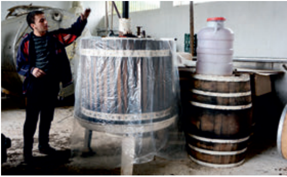
“Kataro” wine production facility in Tugh village of the occupied Khojavand district | Photo from www.hetq.am | 21 May 2014