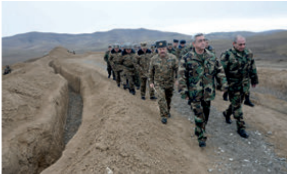
President of Armenia inspects the front line in the occupied territories | Photo from www.president.am | 03 January 2012

The movement of personnel in political and military leadership echelons between Armenia and the subordinate separatist regime and reshuffling of military commanders of Armenia with the warlords of the separatist regime is another striking evidence of their integration. The most recent example is the rotation between the Deputy Chief of General Staff of the armed forces of Armenia, Levon Mnatsakanyan, and the so-called “minister of defence” of the separatist regime, Movses Akopyan, officially approved by the decree of President Serzh Sargsyan of Armenia, dated 15 June 2015. 29