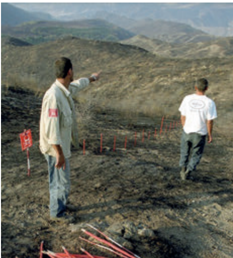
Halo Trust activities in the occupied Lachyn district

Most of the crops, wheat, barley and corn harvested in the occupied territories are transported to Armenia for domestic consumption and possibly for re-export. 407 According to Arthur Aghabekyan, so-called “deputy prime minister” of the separatist regime, in 2012 alone, some 20,000 tons of grain were transported to Armenia. 408 He also informed that the Armenians from Khankandi “obtained” land in the occupied Aghdam district and were cultivating it.