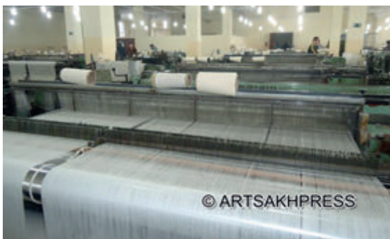
Sanderk LLC textile company production facility in the occupied territories

Many production facilities in the occupied territories process their materials at least partially in Armenia. For example, Sanderk LLC textile company (with the capacity of some 10 tons of