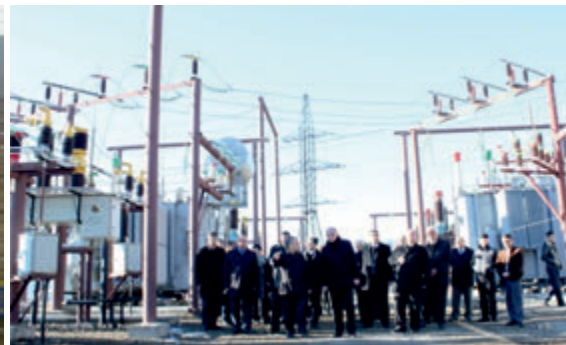
Newly built transformer substation in the vicinities of the occupied town of Shusha