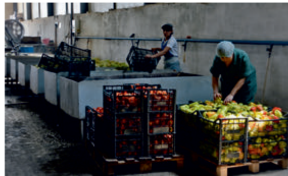
"Artsakh Fruit CJSC" production facility in the occupied territories of Azerbaijan | 27 August 2014

The Government of Armenia is supporting and encouraging production and export of the products unlawfully produced in the occupied territories. In August 2014, President Serzh Sargsyan of Armenia visited Tagavard village in the occupied Khojavand district and got acquainted there with the work of vegetable oil producing plant. 299 In January 2012, he visited the wood processing enterprise and a pellet producing unit in Chanagchy village of the occupied Khojaly district. 300