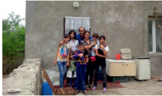
Armenian settlers in Gushchu village of the occupied Lachyn district | 14 September 2015

and mechanical growth. 134 In 2001, a 10-year strategic plan was adopted aimed at resettling a total of 36,000 settlers. 135 As a result of the implementation of various resettlement programs in 1994-2004, some 7263 families (18,500 people) were transferred into the occupied territories. 136 By 2011, some 25,000-30,000 people were reportedly settled in those territories. 137