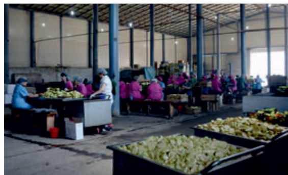
“Artsakh Fruit CJSC” production facility in the occupied territories | Photo from hetq.am | 27 August 2014