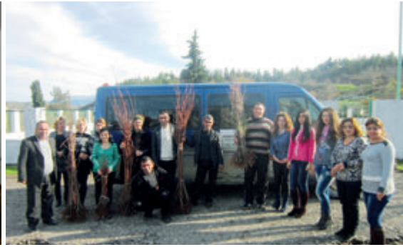
"Armenia Tree Project" provides fruit trees for the newly arrived Syrian Armenians settled in the occupied Lachyn district | 16 June 2015

As per other sources, as of 2015, the number of Armenian families from Syria settled in the occupied territories reportedly reached several hundreds. Given that, according to the Republic of Armenia's Ministry of Diaspora, more than 16,000 Syrian Armenians have entered Armenia since March 2011, and at least 11,000 continue to reside in Armenia, the number of those settled in the occupied territories is likely to be much higher. They were allotted with either newly built homes or apartments in renovated buildings. Those families deciding to stay and adapt are promised the property ownership certificate. Regardless of how many Syrian Armenians currently reside in the occupied territories, their presence in those territories serves as an incentive for more their compatriots and relatives to move from Syria and from Armenia, given the continuing instability in Syria and dire economic conditions in Armenia. 176