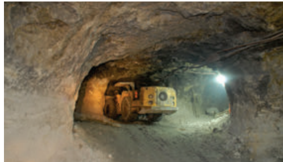
Sweden's Atlas Copco Wagner underground mine truck of Armenia's Vallex Group is seen working in the underground Gyzybulag gold and copper mine near Heyvaly village in the occupied Kalbajar district

The occupied territories are also rich in different types of building materials, including face stone, block stone, different types of construction stones, loam, sang-gravel chromite, lime, marble and agate. There are lime and clays deposits in Chobandag, Shahbulag, Boyahmedi (Aghdam); marble deposits in Harovdad and Shorbulag; tuff deposits in Kilseli (Kalbajar); pearlite deposits in Kechaldag (Kalbajar) etc. 415 Furthermore, there are more than 120 mineral water deposits. Among them are Yukhary (Upper) and Ashahy (Lower) Istisu, Bagrysag and Keshdak in the Kalbajar district; Iligsu and Minkend in the Lachyn district; Turshsu and Sirlan in the Shusha district.