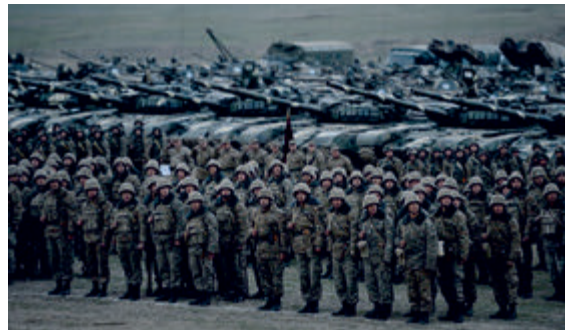
President of Armenia Serzh Sargsyan attending the military exercises of Armenia’s armed forces in the occupied territories of Azerbaijan | 14 November 2014