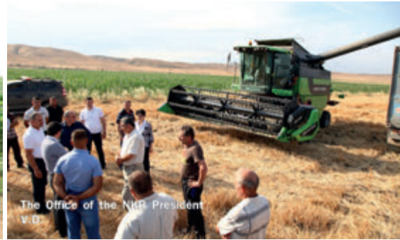
Bako Sahakyan visits agricultural fields near Talysh village in the occupied part of the Tartar district | 27 June 2015