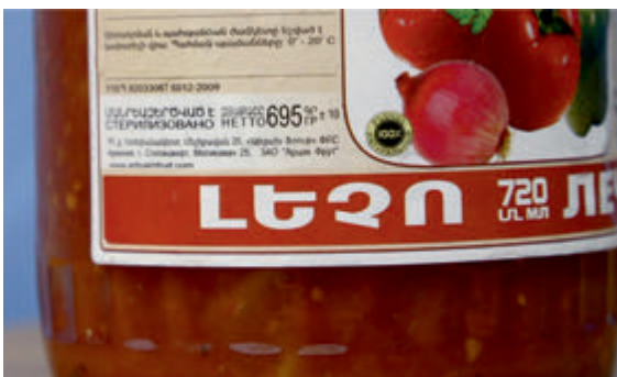
A label on the “Artsakh Fruit CJSC” product reads “Stepanakert, Armenia” | 23 July 2014