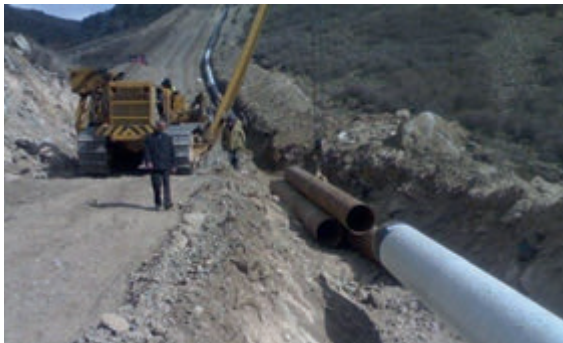
Armenia’s Dorozhnik LLC company built transmission pipeline for water flow of Toraghaychay River in the occupied Kalbajar district into the Sarsang reservoir

Armenia’s ArmWaterProject Company Ltd. directly participates in appropriation of the water resources from the occupied territories and is involved in rehabilitation and construction of the irrigation system in those territories. 383 ArmWaterProject and Cornerstone companies completely re-built 30-km-long canal to bring water to the arable lands in the occupied Jabrayil district. 384 The canal has capacity to drive up to 8 cubic meters of water per second and is capable of providing gravity-flow irrigation for around 5 thousand hectares, which can reach 8-9 thousand hectares