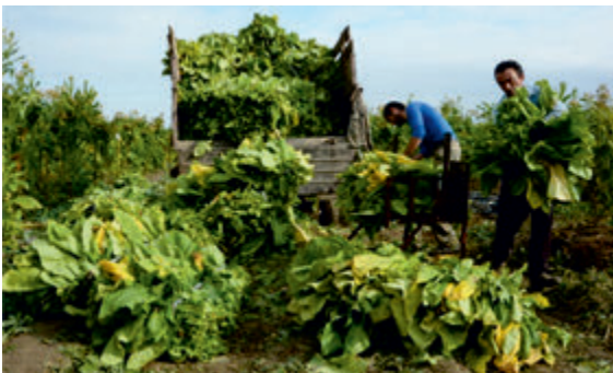
Armenia’s “Grand Holding Inc.” cultivates tobacco in the occupied territories, including in the occupied part of the Aghdam district | 25 November 2014